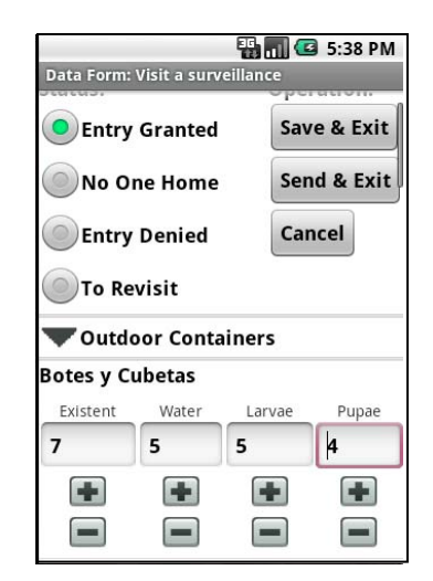
Figure 2. Phone Client Screenshot Showing Details of One House