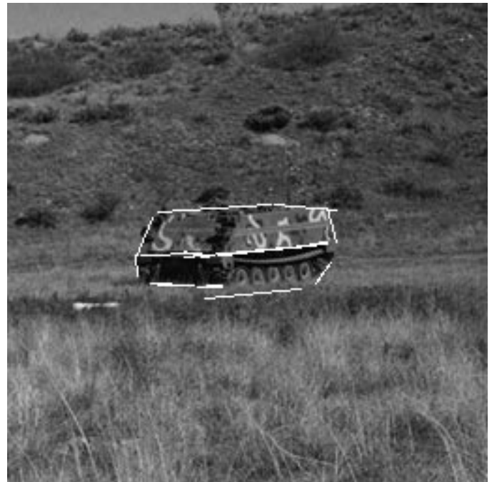
b. Data Lines