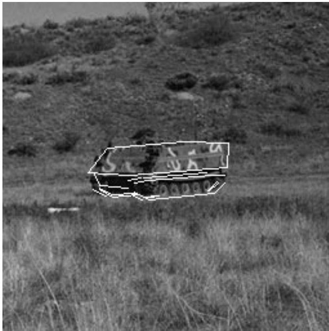
a. Model Lines